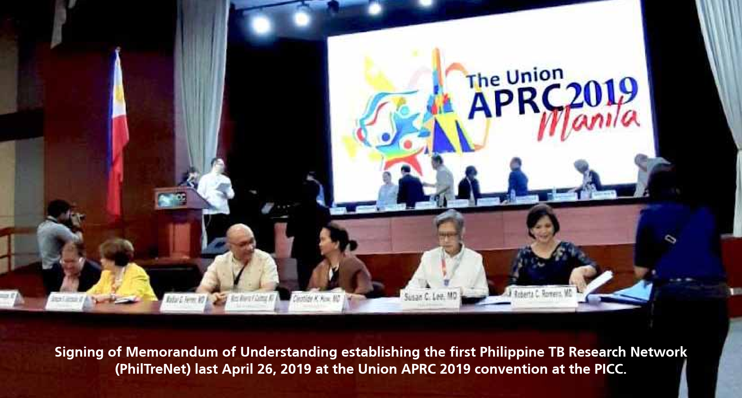
Signing of Memorandum of Understanding establishing the first Philippine TB Research Network (PhilTreNet) last April 26, 2019 at the Union APRC 2019 convention at the PICC.